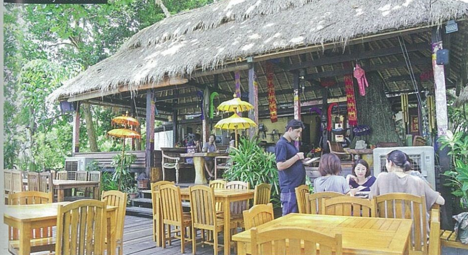
Tree Monkey Restaurant

Steakhouse SteakFrites@23 23 Love Lane, George Town (+604 262 1323/ www.23lovelane.com ). SteakFrites's straightforward dining experience revolves around just one dish: the European staple of steak and fries. Only two decisions are required of you: 150g or 200g of Australian grass-fed tenderloin? And how well do you want your meat done? Pork-free. Child-friendly. Daily, 7-10.30am; 4.30-10.30pm. $$$$